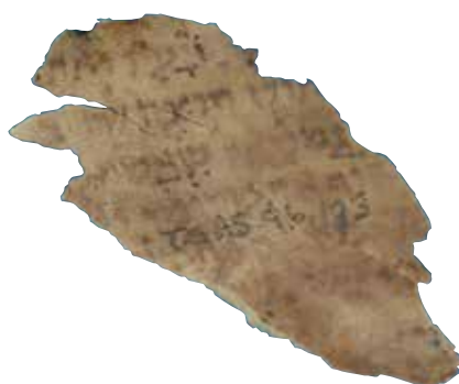
Small fragment with an individual shelfmark

Approximately 2,500 images of multiple minute fragments were examined. When a small fragment was found to originate from the Babylonian Talmud, it was compared to other previously identified fragments. In many cases the minute pieces contributed to the understanding of the larger fragments to which they joined.