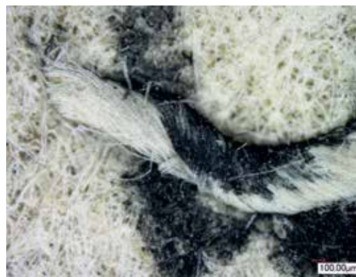
Detail of T-S 13J9.5 at x100 magnification. Note the textile thread visible in the paper.

This is clear evidence that this paper was made from textiles similar to those found in papers from along the Silk Road, mentioned above.