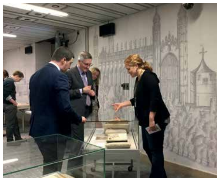
Above: Visitors examine Genizah fragment T-S 8J22.25 , part of a pop up exhibition 'Queering the UL' in Cambridge University Library, featuring LGBT+ related materials from its historic and modern collections to mark LGBT History Month.