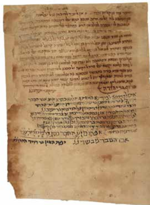
T-S 13J9.5. A legal document, the lower part written by Ephraim ben Shemarya, head of the Palestinian Rabbanite congregation in Fustat between 1016 and 1055.