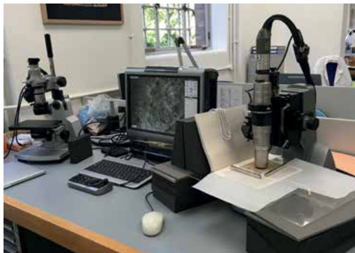
Our work bench: Keyence digital microscope