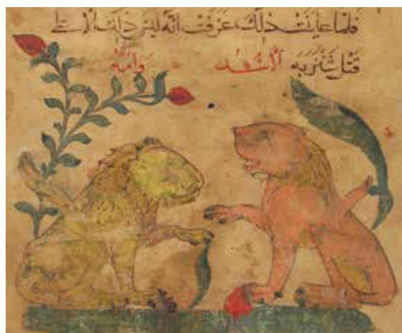
Detail of T-S Ar.51.60: an illustrated leaf of Kalila wa-Dimna .

As it is natural for an exhibition centring on religion, a great range of texts in a variety of languages, scripts and writing styles was presented: Homeric Greek samples, Aramaic seals with Egyptian hieroglyphs, oracle tickets, papyri fragments of the New Testament and apocrypha, discussions on divine powers, biographies of Coptic saints, magical instructions, love spells and curses, alongside the famed Codex Sinaiticus and an