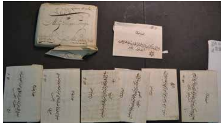
Above: Large envelopes contain a number of smaller letters. Note the star of David on the letter at the top right.

colloquial expressions, pseudo-literary phrases and coded trade language. This, however, means that they are also rather inaccessible, especially as there are so few sources with which they can be compared. By sheer luck, I was made aware of a similar collection of Arabic letters in the Prize Paper Collections, housed at The National Archives at Kew Gardens. These Arabic letters were seized in 1759 by British privateers as part of the loot on a Tuscan ship bound for Alexandria; some of them sent to Jewish individuals may well have ended up in the Genizah had they not been intercepted. They have been virtually untouched since that time – most of the letters were still unopened when I first viewed them and they