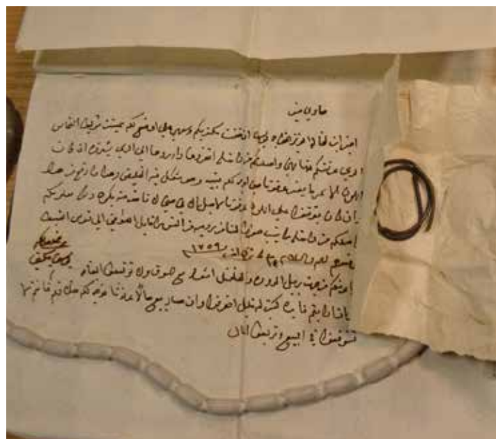
One of the Prize Paper letters contains a wire sample.

remain in the pristine condition in which they were archived in the 18th century.